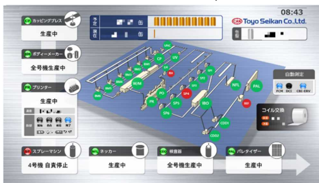
Visualization of the operation status of entire production line